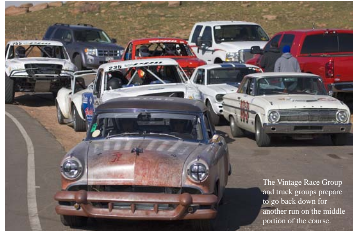
The Vintage Race Group and truck groups prepare to go back down for another run on the middle portion of the course.

the best time achieved on the qualification section of the course, which is typically the lower section. Some racers found that getting up to race at 3:00am was a challenge, but the multiple runs and hours of practice times each day were well worth it.